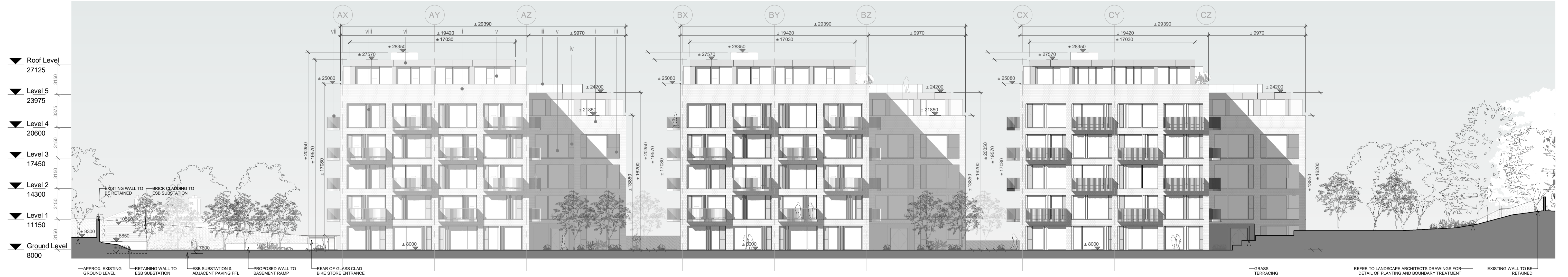
3 Overall Elevation - South scale 1 : 200